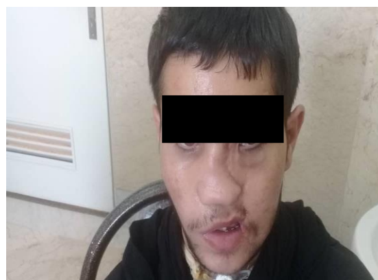
Figure 1. Facial reconstruction by plastic surgeon after suicide attempt via gunshot plan

Klebsiella pneumonia (MDR and CRE) and Pseudomonas aeruginosa (PDR and CRE) were obtained by microbiological examination of secretions. Inject able antibiotic treatments were performed for him. The patient also underwent surgery to block blood flow and blockage of arteries following severe injuries. He was then referred to a psychiatrist for counseling and psychotherapy. The psychiatrist reported the patient showing no psychosis or major depressive disorders, no symptoms for bipolar spectrum, obsessive-compulsive disorder, and judgment was not impaired. Suicide and homicide thought were not present at that time.