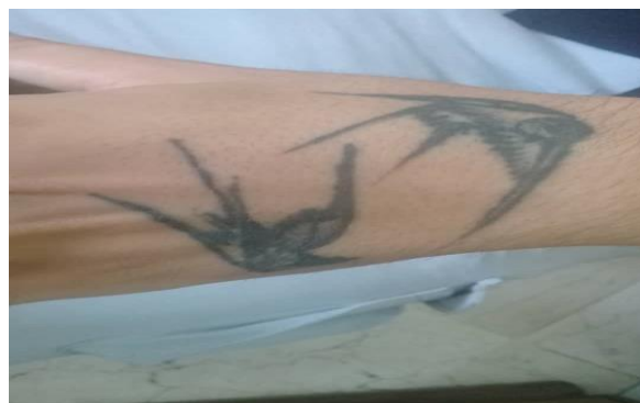
Figure 2. Tattoo incubation as love symbolization on left dorsum of hand